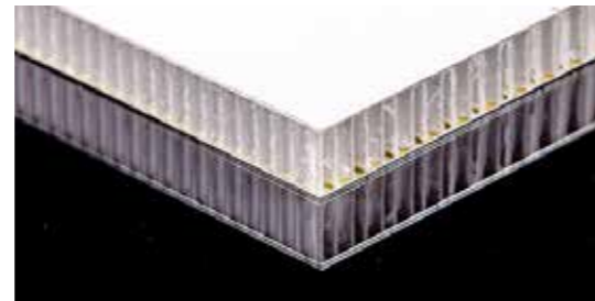
As of March 2024, we have introduced lightweight truck floors. These thermoplastic monolithic composite panels are fully recyclable and are no longer bonded but instead welded.